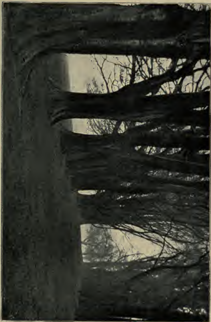
'IN THAT GLADE, WHERE FOLIAGE BLENDING FORMS A GREEN ARCH OVERHEAD'